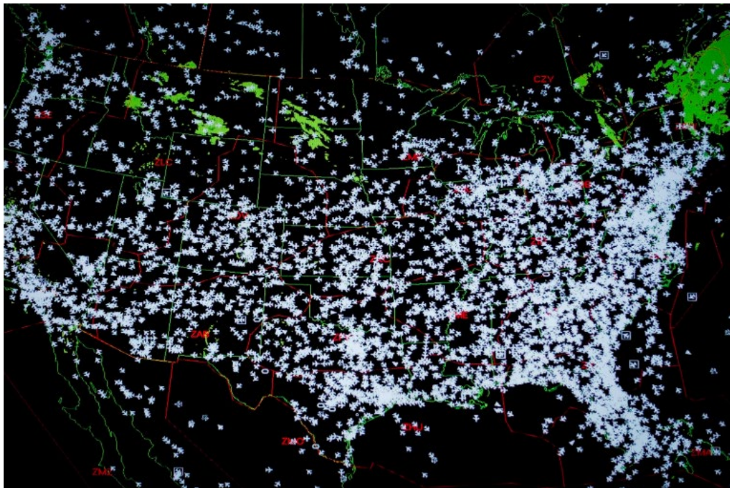
A computer monitor displays active aircraft traffic over the United States at the Air Traffic Control System Command Center on Friday in Warrenton, Va. The facility balances air traffic demand with system capacity in the National Airspace System and is part of the Federal Aviation Administration air traffic control system.

Alaska Air Carriers Association | 907.277.0071 | aaca@alaskaaircarriers.org | www.alaskaaircarriers.org